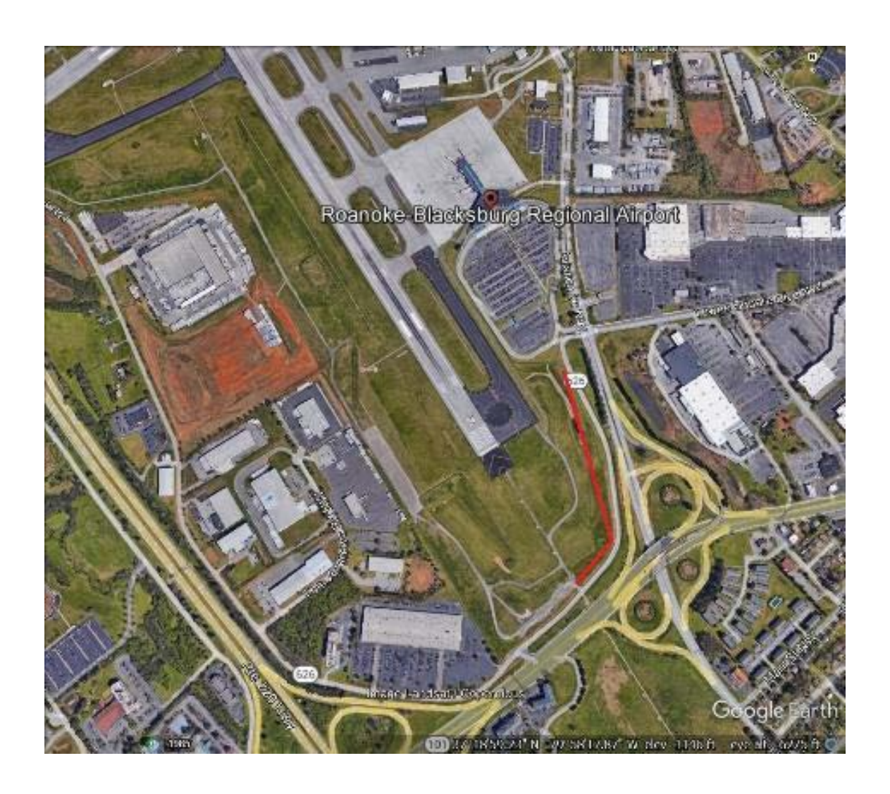
End of Addendum #2